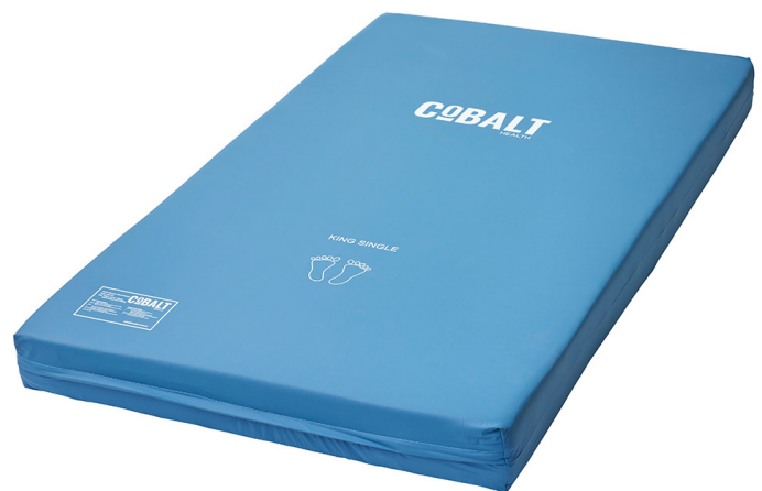
Memory Foam Mattress