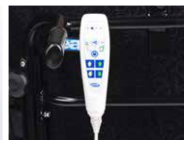
Option for electric adjustment of tilt and recline via a hand control that can be used by the attendant or user.