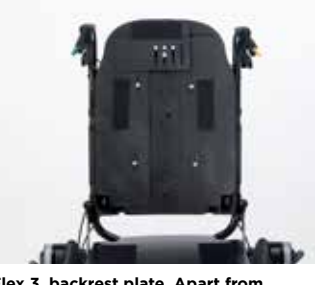
Flex 3, backrest plate. Apart from being height adjustable it is now width adjustable as well.