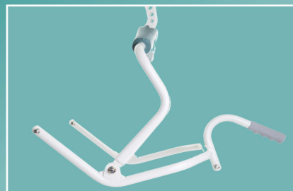
Pivot Frame - 2211038