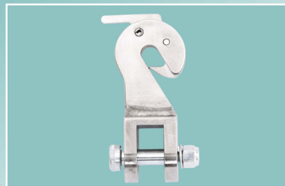
Quick Release Adapter - 2911039