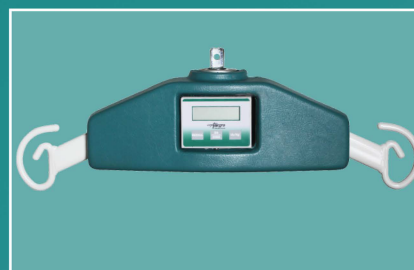
Standard Yoke with Integrated Weigh Scale - 2211037