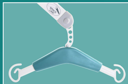
Standard Yoke - 2211030

The Allegro Concepts range of patient lifting equipment including lifters, slings and accessories has been designed and tested to comply with: AS ISO 10535-2011 Hoists for the transfer of disabled persons – Requirements and test methods.