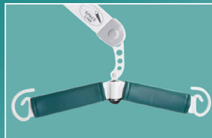
Hi Lift Yoke - 2211032