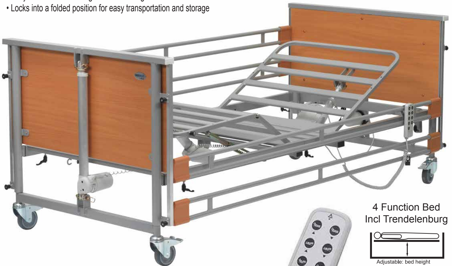
4 Function Bed Incl Trendelenburg