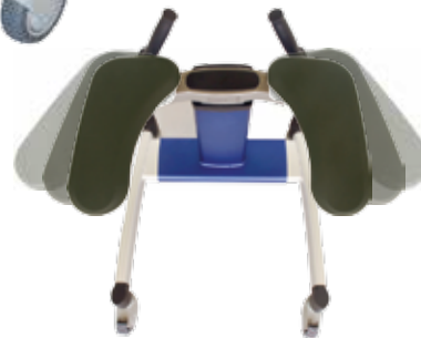
Width/angle adjustable forearm supports