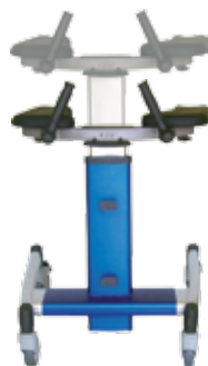
Automatic hydraulic armrests. Height adjustable system, operated by a lever