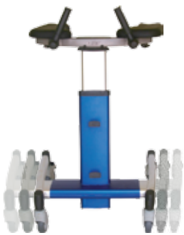
Width adjustable base